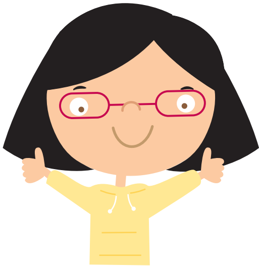
artwork ©2015 Utah Dual Language Immersion