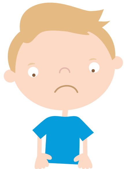
artwork ©2015 Utah Dual Language Immersion